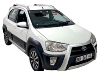
2016 Toyota Etios Cross White - 24,000km R155 000