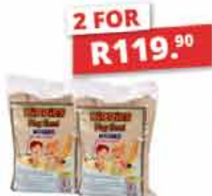
KIDDIES PLAY SAND 20kg R64.90 EACH | sc29452