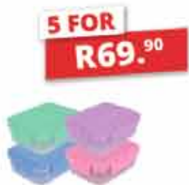
OTIMA QUATRO 600ml R19.90 EACH | ASSORTED COLOURS