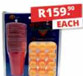
BEER PONG WITH 24 CUPS sc100064