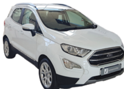
2019 Ford Ecosport 1.0 Ecoboost Titanium - 45,200km R295 999