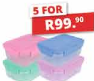
OTIMA QUATRO 1.6lt R27.90 EACH | ASSORTED COLOURS