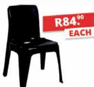
DEZI CHAIR BLACK sc89730