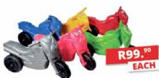
BIKE ASSORTED COLOURS