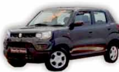
2021 Suzuki S-Presso (still has factory warranty and service plan)