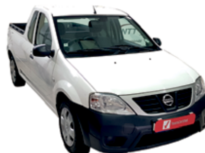
2015 Nissan NP200 1.5 Dci White - 126,000km R150 000