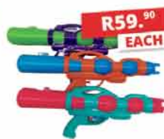
WATER SQUIRTER LARGE ASSORTED COLOURS | sc129909