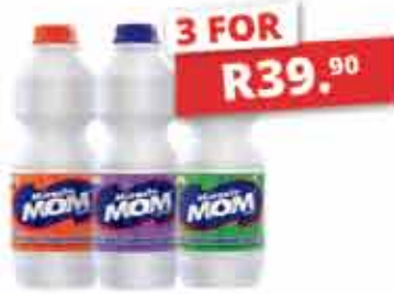
MIRACLE MOM 1lt R16.90 EACH