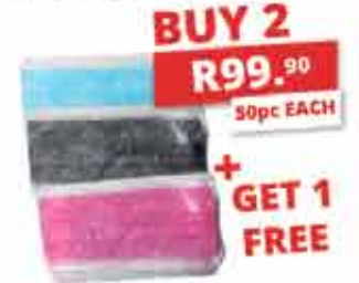
3ply COTTON MASK ASSORTED 50pc