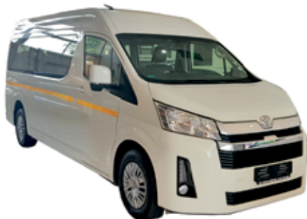
2020 Toyota Quantum GL 14 Seater - 18,000km R557 750