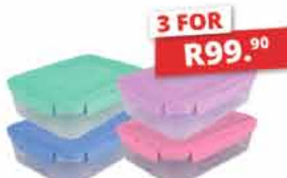
OTIMA QUATRO 3.5lt R39.90 EACH | ASSORTED COLOURS