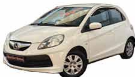
2014 Honda Brio I-VTEC (extremely fuel efficient)