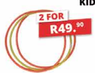
HOOLA HOOPS R29.90 EACH | ASSORTED COLOURS