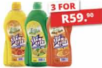
STARLITE DISHWASH 1.5lt R24.90 EACH