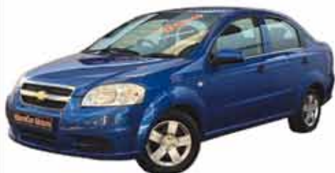
2009 Chevrolet Aveo 1.6 LS Automatic

BAD CREDIT? UNDER DEBT REVIEW? BLACKLISTED? UNDER SEQUESTRATION? DO YOU EARN R10 000 PER MONTH OR MORE? NO ITC CHECKS! DO YOU HAVE A VALID DRIVER'S LICENSE? DID YOUR DRIVER'S LICENSE EXPIRE? WE CAN ASSIST. NO DEPOSIT RENTAL DEALS TO QUALIFYING CUSTOMERS