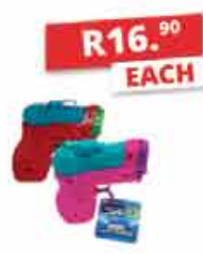
WATER SQUIRTER SMALL ASSORTED COLOURS | sc129903