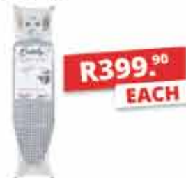
IRONING BOARD MESH TOP 91x30cm WHITE | sc90394