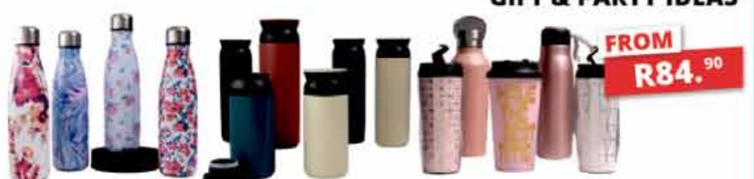
ASSORTED DOUBLE WALL FLASKS AND TRAVEL MUGS OPTIONS VARY IN-STORE