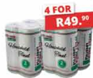
WEST PACK KITCHEN TOWELS 2's | sc113632