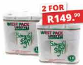
WEST PACK 2ply TOILET PAPER 18 ROLLS 350 SHEETS | sc114435