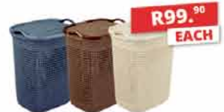
KNIT LAUNDRY BASKET ASSORTED COLOURS