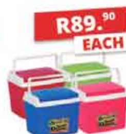
COOLER BOX 8lt ASSORTED COLOURS