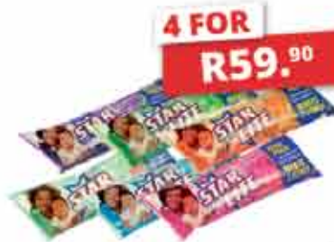
STARLITE REFILL FABRIC SOFTENER 500ml R16.90 EACH