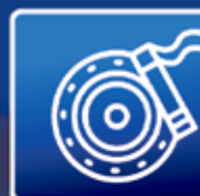
SKIM & REBOND