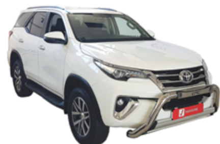
2020 Toyota Fortuner 2.8 GD-6 Epic A/T - 16,900km R639 999