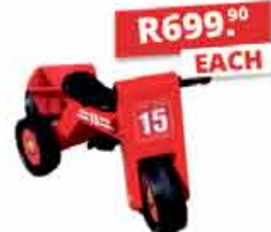
TRICYCLE WITH BASKET ASSORTED COLOURS