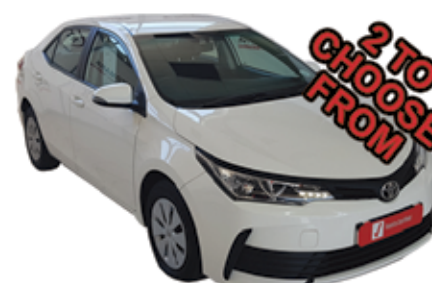
2020 Toyota Corolla Quest 1.8 CVT - 23,000km R265 000