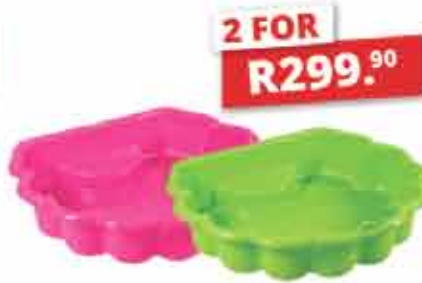
SUNNY SHELL SAND PIT R159.90 EACH | ASSORTED COLOURS