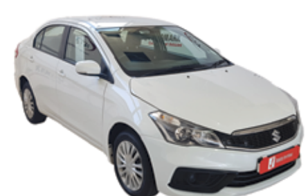
2020 Suzuki CIAZ 1.5GL 16,930km R190 400