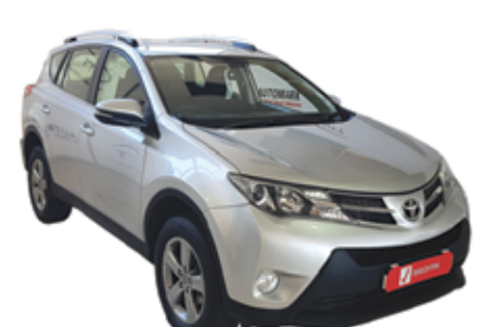
2015 Toyota RAV 4 2.0 GX A/T - 135,000km R265 999