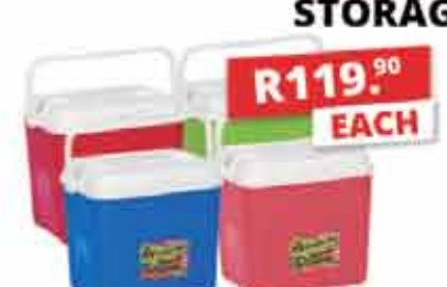
DIAMOND COOLER BOX 25lt ASSORTED COLOURS