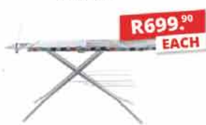
IRONING BOARD MESH TOP 122x38cm WHITE | sc88233